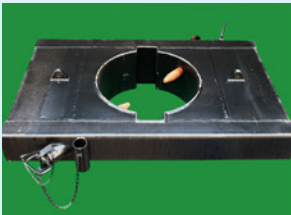
Lifting table spud leg